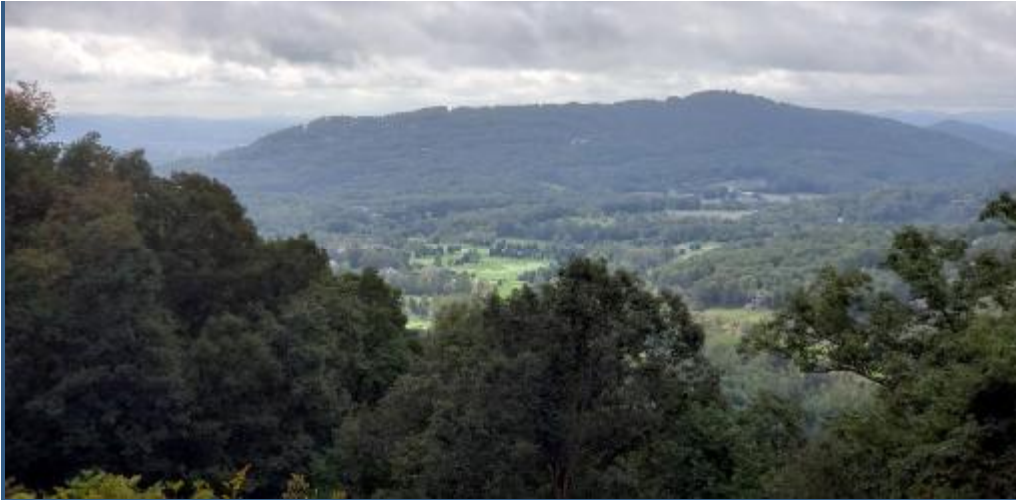
Some sun shining on the golf course below