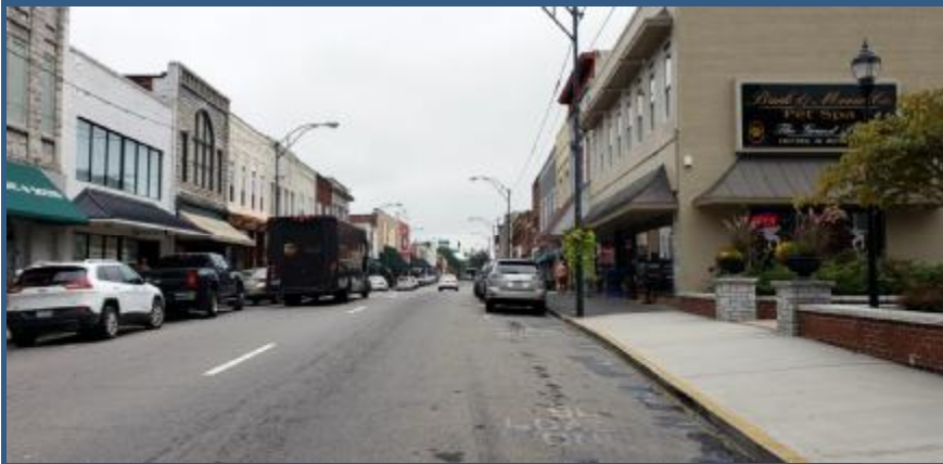
Downtown Mayberry. Really it's Mt Airy, North Carolina