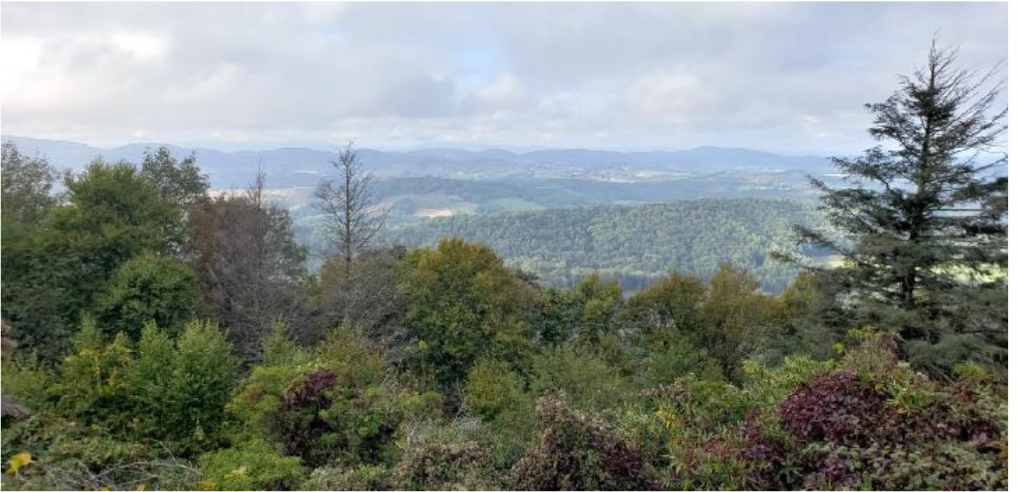
A fella on a Harley told me this was the best view from the Parkway anywhere in North Carolina