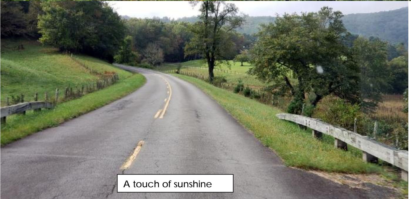
A touch of sunshine