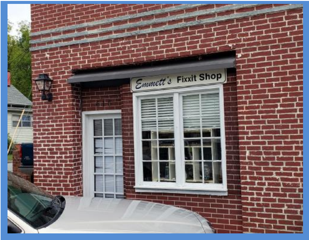
Emmett himself was a fixture in many episodes