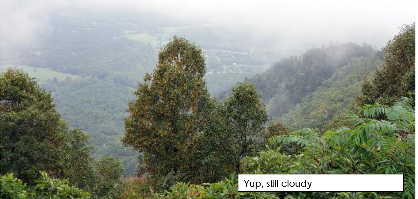
Yup, still cloudy