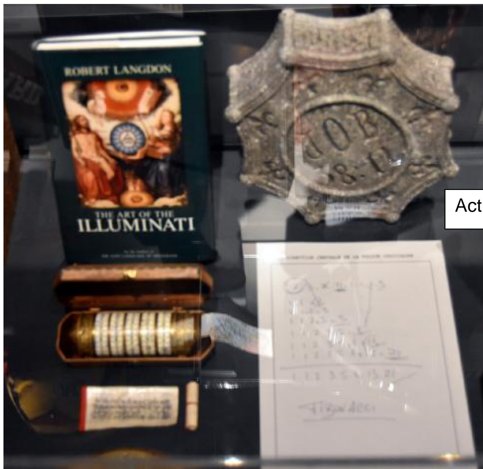
Actual props from the movie