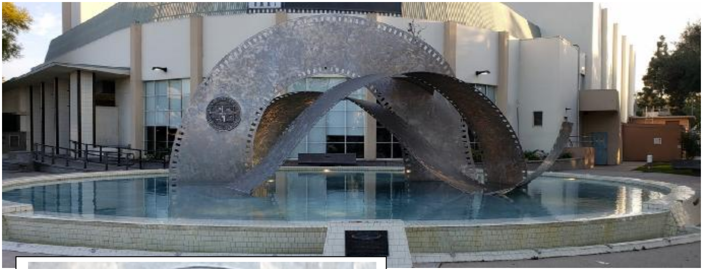
This artwork was on the way.