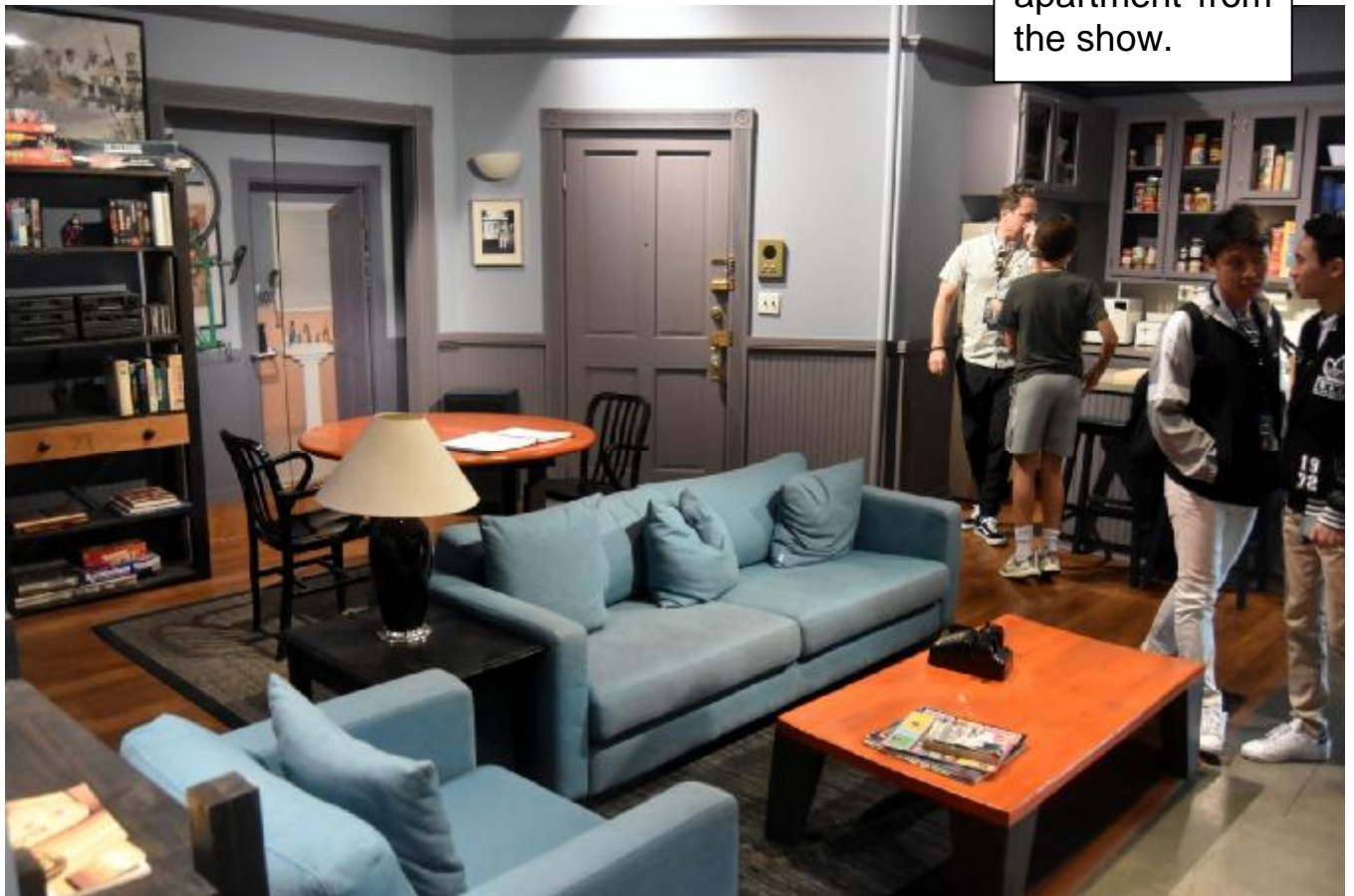
Jerry Seinfeld's apartment from the show.