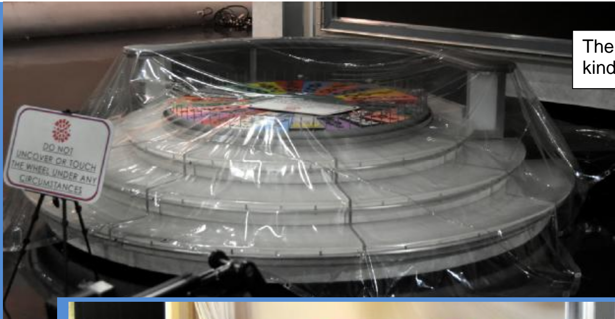
The 'only one of its kind' Wheel