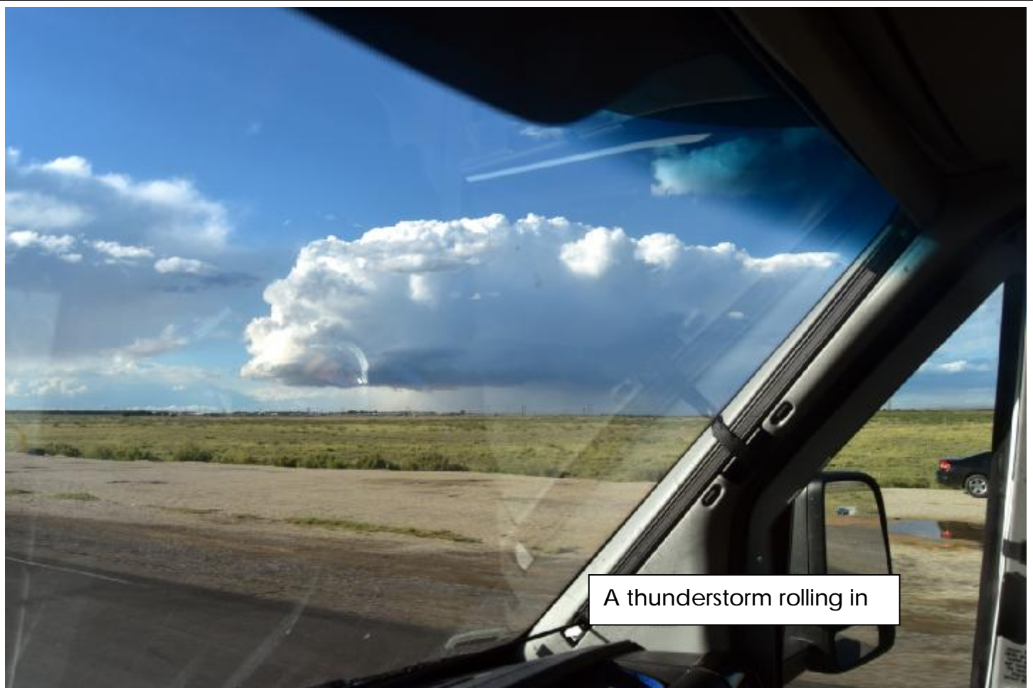
A thunderstorm rolling in