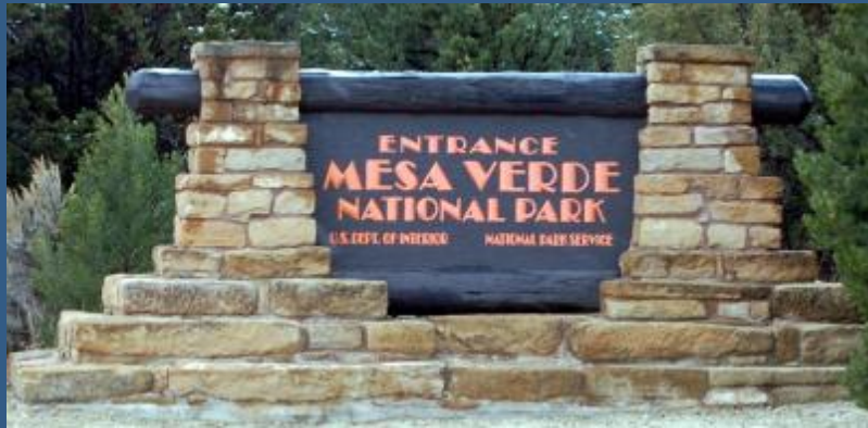
The first National Park of the Trip