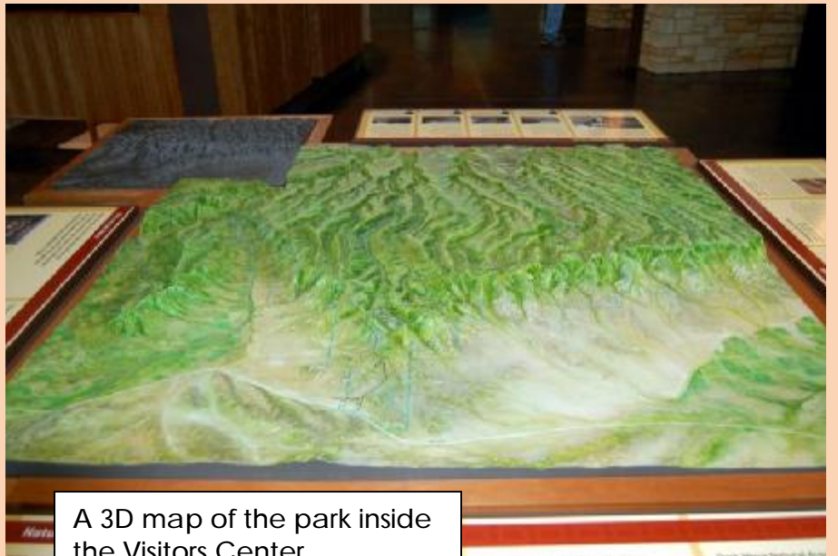
A 3D map of the park inside the Visitors Center

effort to better accommodate increasing visitation of the nation's parks. The Mesa Verde Foundation, a philanthropic nonprofit, is now working closely with tribes affiliated with the park to develop a Tribal Cultures Center and Dance Plaza. The refurbished center will celebrate the tribe's contemporary cultures through visual and performing arts while providing a link to their ancestral past.