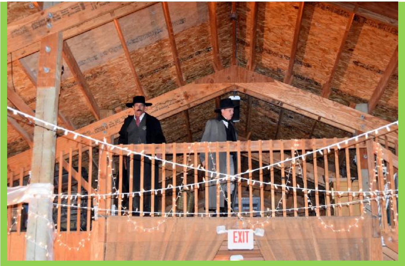
After we were all given our Deputy Marshall badges, to our surprise Wyatt Earp and Doc Holliday showed up themselves to swear us in as Deputies