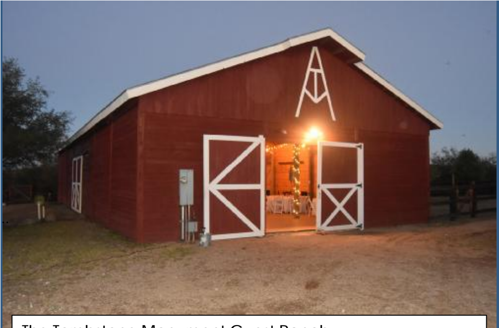
The Tombstone Monument Guest Ranch